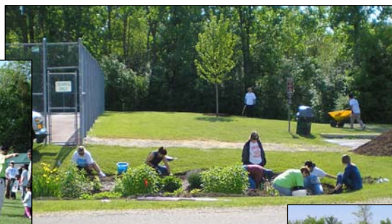
Rotary Park, Novi