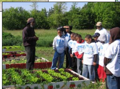
D-Town Farm, Rouge Park, Detroit