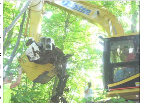
Aristeo Construction removed 3 vehicles and other debris from the Rouge River in Detroit's Rouge Park

Over 2,200 volunteers joined forces to Rescue the Rouge at 37 worksites in 25 communities in Southeast Michigan for Rouge Rescue 2009. Volunteers removed 76 cubic feet and 710 bags of trash including tires, construction debris, furniture, appliances and bicycles from the river corridor. Four cars were removed from the river this year, thanks to the continued participation of Aristeo Construction who removed 3 and the Detroit Water and Sewer Department (DWSD) for removing the 4 th . This brings the total number of cars removed during Rouge Rescue events to 20 ½ since 2006. The Friends of the Rouge team appreciates Aristeo Construction and DWSD supplying the equipment and manpower to remove these eyesores from the river.