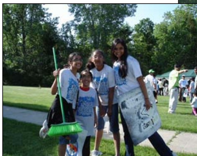
Meadows of Canton Neighborhood, Canton