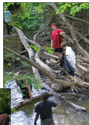
Lola Valley Park, Redford