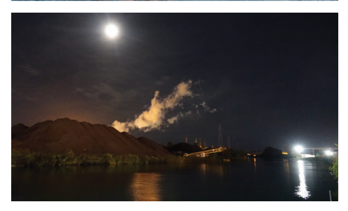
The Rouge Burn Anniversary, October 10, 2019 at Marine Pollution Control in SW Detroit commemorated the 50th Anniversary of the Rouge River fire of 1969 and celebrated all the incredible collaborative work to restore the Rouge. The event featured dinner, live music, Downey Brewing Company beer specially brewed for the event called "Oil Slick Stout," a visit from the Curtis Randolph, Detroit Fire boat and tours with Marine Pollution Control staff of the old channel of Zug Island.