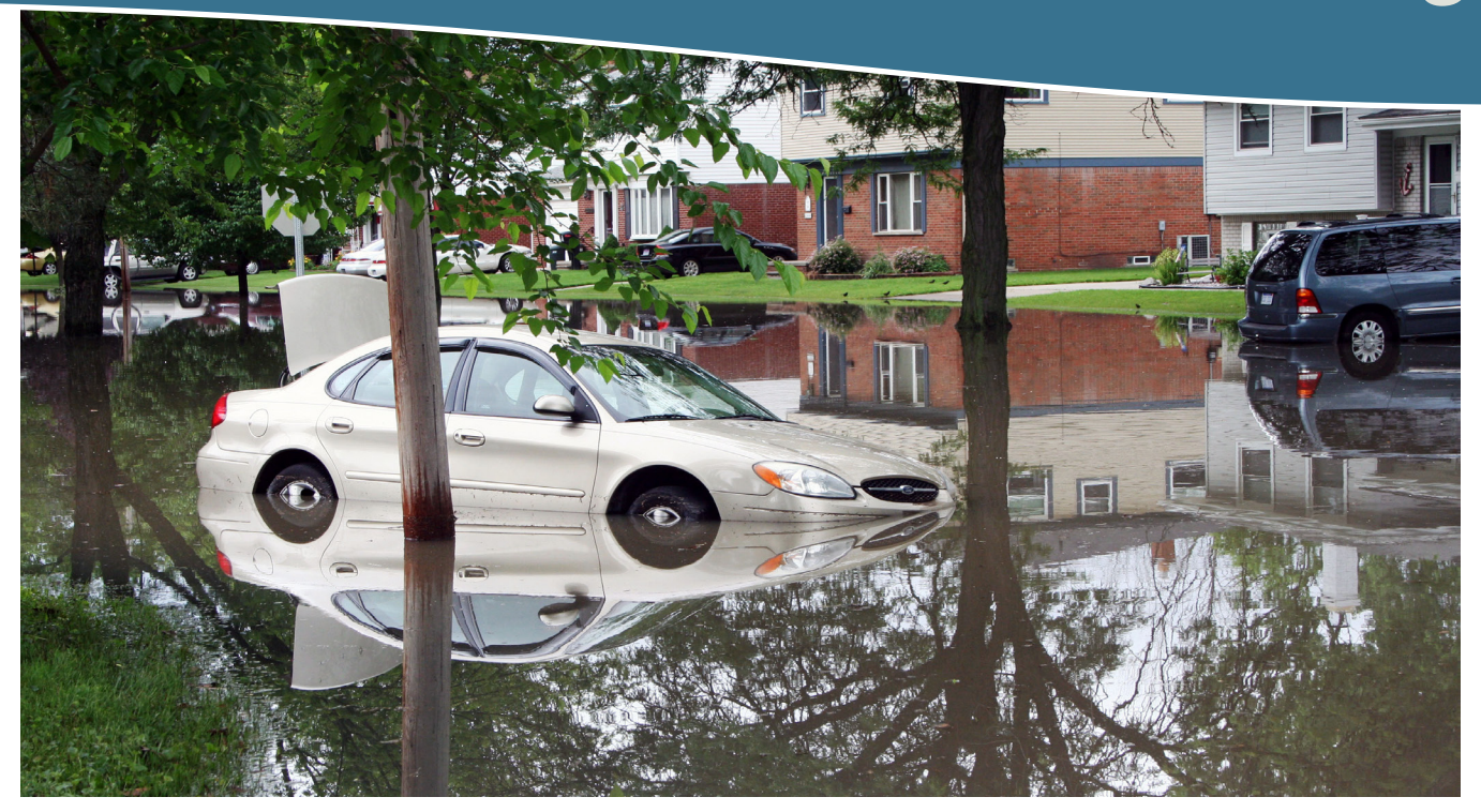
Flooding in Dearborn Heights